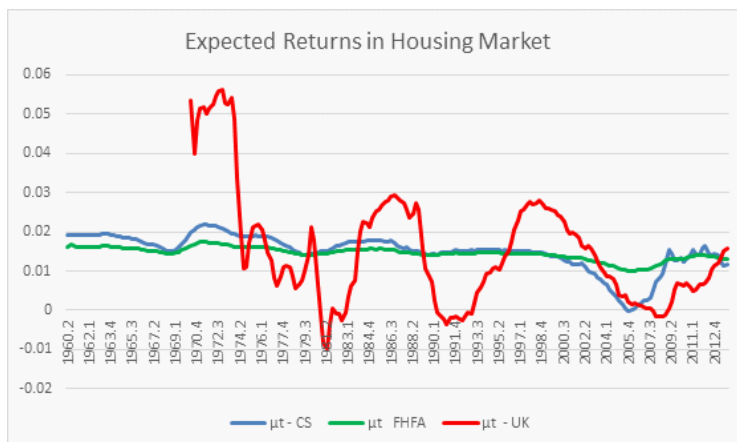
Figure 1: Expected Returns: The graph illustrates the expected returns on houses over time. The red, blue and green line relate to the UK, US-Case-Shiller and US-FHFA.